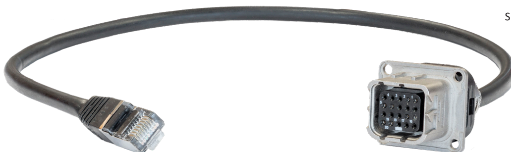
SIM monomodule connector / RJ45 connector + cord